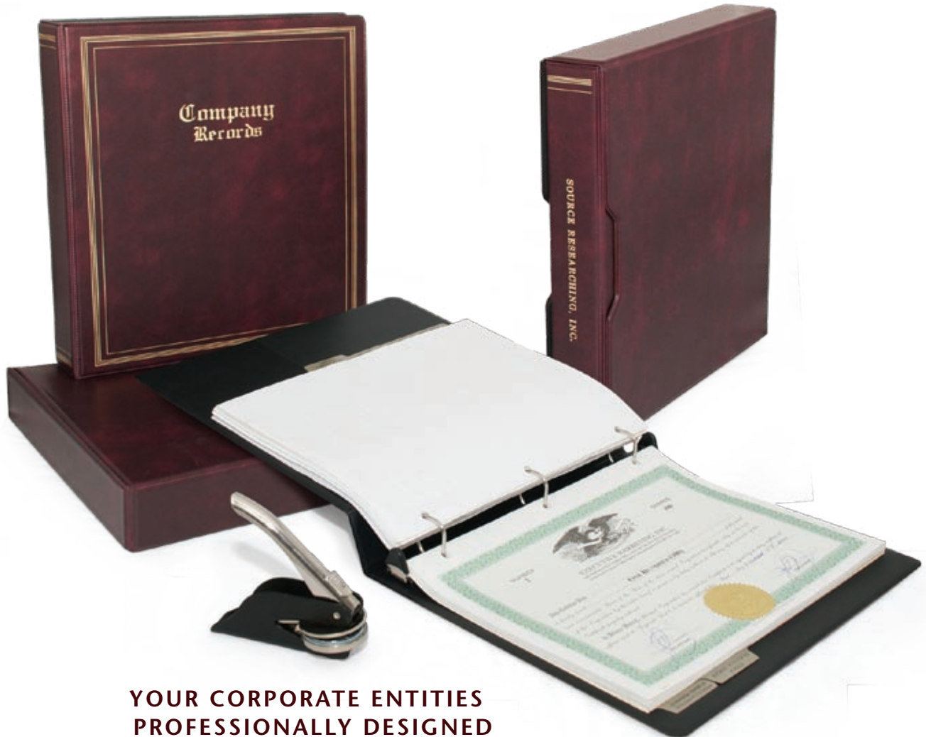
YOUR CORPORATE ENTITIES PROFESSIONALLY DESIGNED