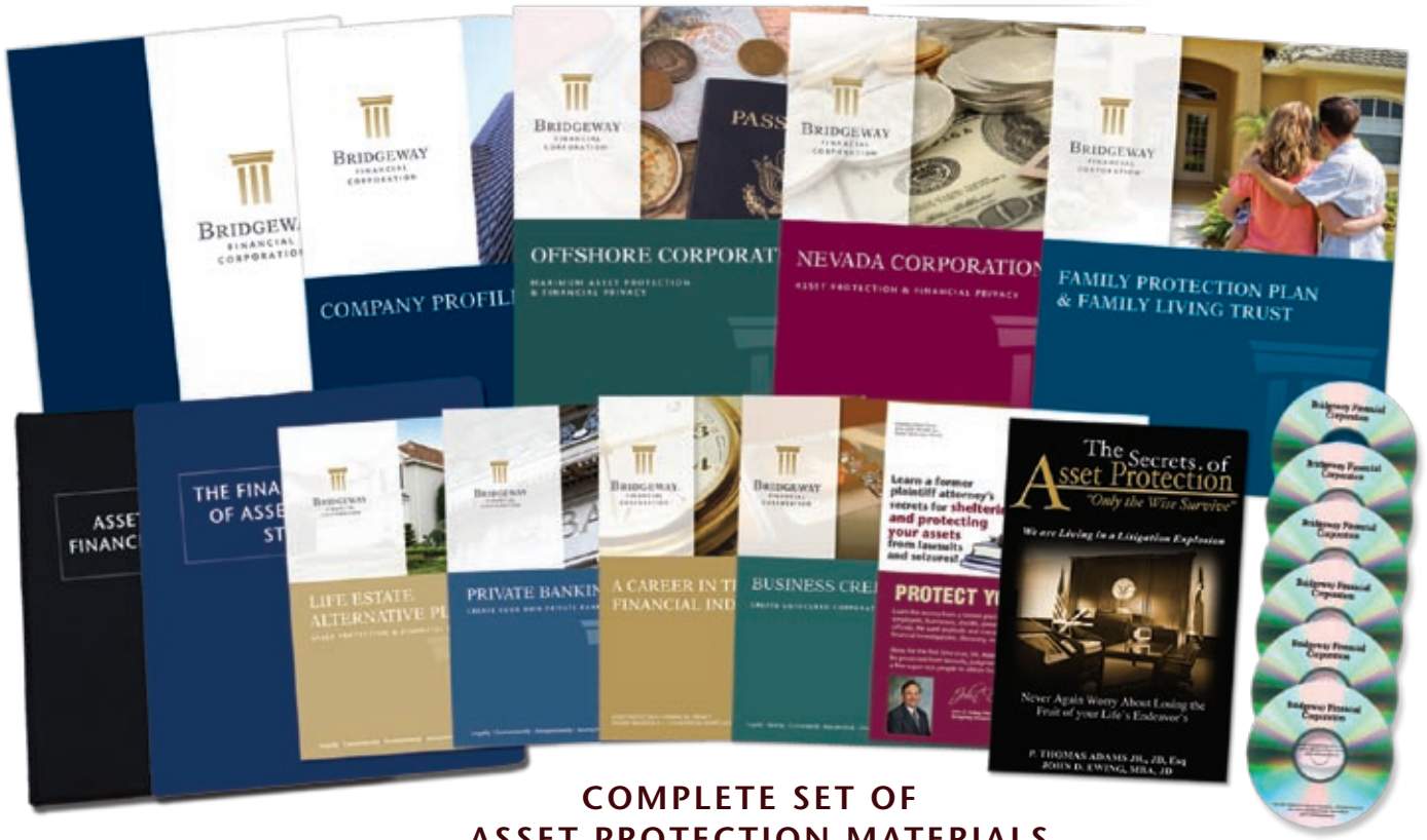
COMPLETE SET OF ASSET PROTECTION MATERIALS