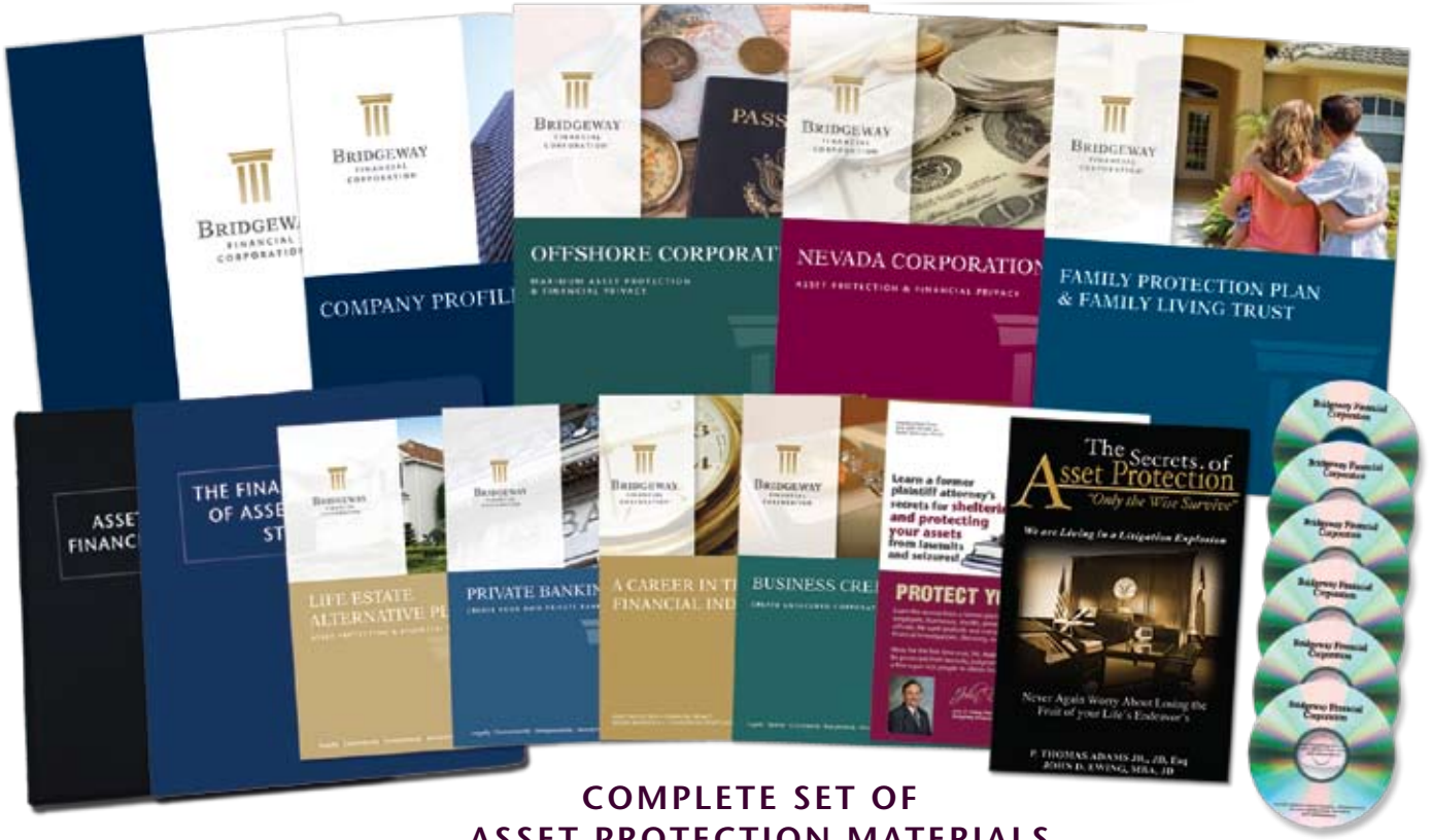
COMPLETE SET OF ASSET PROTECTION MATERIALS